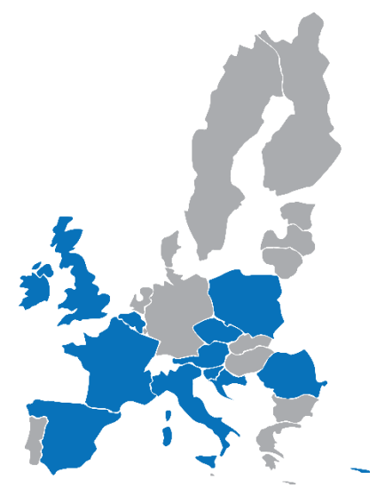
Figure 3. Explicit references to forms of gender-based violence in sport in policies of EU Member States

Various policy documents from across different sectors make explicit reference to forms of gender-based violence within sport. These are described below. They include national strategies, programmes, action plans, or codes of ethics within the policy areas of sport, gender equality, and child protection. There are also numerous examples of initiatives that have been established to raise awareness of gender-based violence in and through sport. Other relevant initiatives to combat gender-based violence in sport were developed by sport and civil society organisations. These are discussed in Chapter 6.